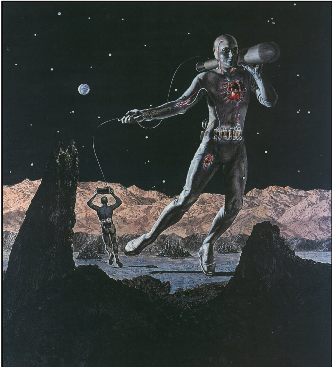
Figure 3.1: Cyborgs in Space. From LIFE, 11 July, 1960, p. 77.

report on NASA's societal impact of that year noted that the Cyborg Study was influential for the development of artificial organs. The report's author acknowledged that the cyborg study was 'the most exotic of the life science studies that NASA has supported to date', 33 but also claimed that Willem Kolff, the creator of the first fully functional kidney dialysis machine and known as the father of artificial organs said that the 'cyborg study